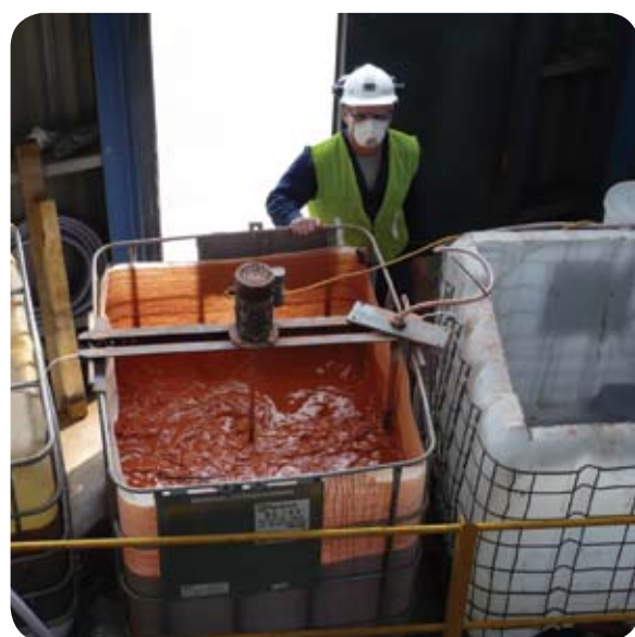
Close up of ElectroBind™ and mixer prior to dosing

When dosing either ElectroBind™ reagent Blend A or Blend B, lead removal efficiencies ranged between 92% and 99.8%. Some of this variation can be explained by the variation in the input lead concentrations, but there is also an indication that most effective lead removal occurred between samples 13 and 20, where ElectroBind™ reagent A was dosed without the addition of ferric chloride, TMT or Amerfloc. It should also be noted that during this sampling period (i.e., between samples 13 and 20) wastewater treatment plant operation was stopped briefly for screen maintenance, which could have affected results. Interestingly, lead removal efficiencies at Samples 5 to 12, when ElectroBind™ dose rate was increased, were not as high as at lower dose rates, with removal efficiencies of 84%-99.7%. With the exception of Samples 8 and 11, all lead concentrations in the treated effluent were below Enthoven's consent targets of 0.5 mg/L.