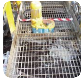
Overhead view of the pre-conditioning tank where raw inlet influent is mixed thoroughly prior to chemical dosing.

Inlet and treated samples were filtered, using 0.2 µm Microsart syringe filters, and analysed for pH and soluble metals. An in-line voltammetry system was used for metals analysis during the project, with results confirmed by ICP at a later date. The pH readings were taken with a Schott bench meter. Inlet Samples 1-12 were taken from Tank 1, prior to the ElectroBind™ addition point. Inlet Samples 13-26 were taken from the raw inlet channel just prior to ferric addition. A comparison of samples taken from Tank 1 and the raw inlet channel is summarised in Table 1. Treated samples were taken from the weir of the final clarifier after Tank 3.