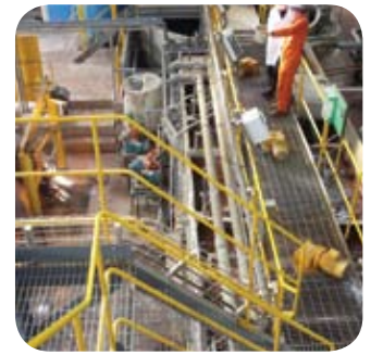
ElectroBind™ was dosed into Tank 1, the first tank at the bottom of this photo; TMT and Merfloc would be routinely closed in the next two tanks (seen under plant operation)

For this purposes of this discussion, we assume that the lead result at Sample 8 is an anomaly (either analytical error or highly elevated lead concentrations in the influent) because there are no related trends or similar results. It is noted that because ElectroBind™ dosing rates were continuously adjusted as a function of influent flow rates and not as a function of contaminant input loads (i.e. a combination of flow rates and contaminant concentrations), any large periodic increases in contaminant concentrations in the influent could result in short term decreases in treatment efficiencies. It may be possible to eliminate such short-term decreases in treatment efficiencies by adding a modest excess of the treatment reagents to provide a safety margin to allow for periodic spikes in contaminant concentrations in the influent fluids. Alternatively, a ballast tank could be used to provide more averaging of influent compositions.