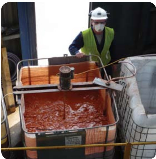
ElectroBind™ and mixer prior to dosing

“Results of this project have clearly shown that the application of ViroFlow™ Technology and the use of ElectroBind™ reagent to treat Enthoven’s wastewater stream was extremely effective in reducing metal contaminants and acidity to below emissions targets.”