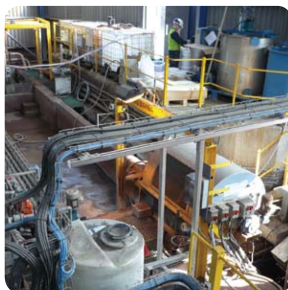
Raw inlet channel running diagonally from top left to centre of photo; ferric chloride is typically dosed in the circular drum, centre, to aid the settling of solids prior to treatment.