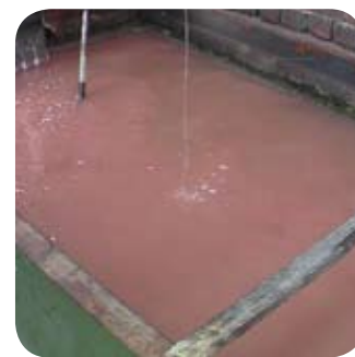
Addition of ElectroBind™ reagent to the mixing tank

After highly successful trials, EPW decided to use ViroFlow™ Technology with ElectroBind™ reagent on an ongoing basis.