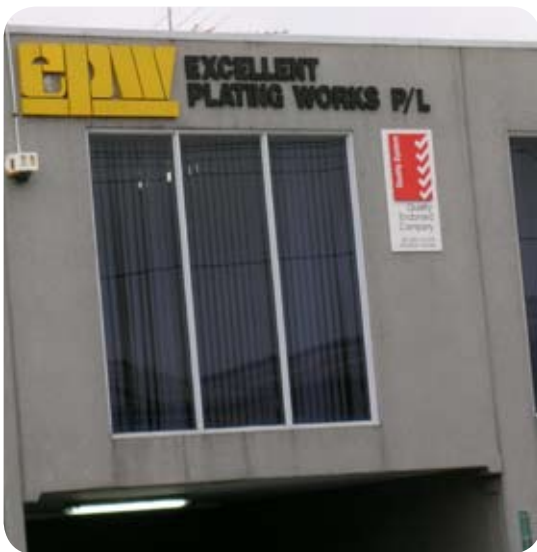
The Excellent Plating Works office

“As a result of implementing ViroFlow™ Technology, EPW is now in a position to recycle water with the electroplating process... EPW is now using ViroFlow™ Technology on a permanent basis.”