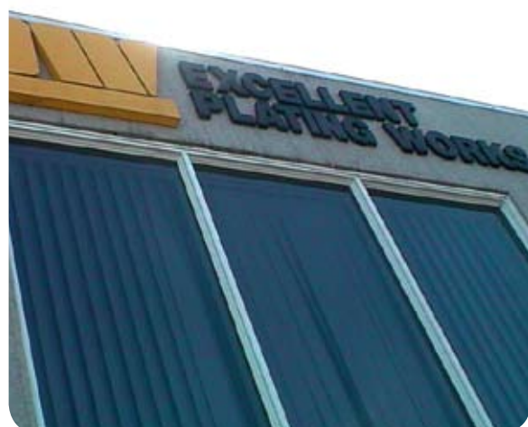
EPW is one of the largest production electro-coaters in Australia.

Excellent Plating Works was established in 1969 as a supplier of zinc electroplated parts and has grown into a company with over 70 employees running four state of the art plating lines at a two acre site in Victoria. EPW is one of the largest production electro-coaters in Australia.