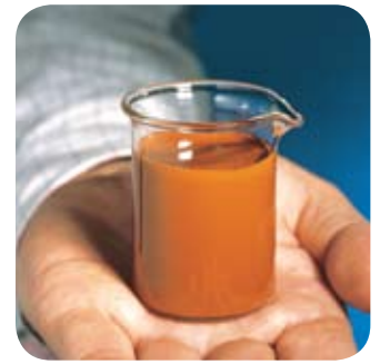
ViroPhos™ reagent was applied in slurry form.

Murphy-Brown, LLC was formed in 2001 when Smithfield Foods acquired, and combined Brown's of Carolina, Carroll's Foods, Murphy Family Farms, and Circle Four Farms, creating what is sometimes referred to as Smithfield Foods Hog Production Group. Murphy-Brown's objective was to assess whether ViroFlow™ Technology could reduce total phosphorous concentrations in nutrient rich water derived from their animal waste streams.