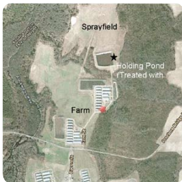
Murphy Brown is located in Isle of White County, Ivor, VA USA.

Murphy Brown is comprised of five separate farms, each housing approximately 1000 sows. The animal waste is separated from hogs and piped to anaerobic lagoons, typically earthen structures. Supernate from these lagoons are then pumped to irrigation retention ponds. This particular study was conducted at Farm #1.