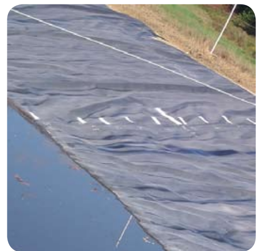
Lagoon scale, inches.