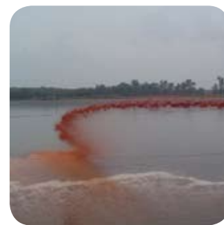
Spray application of ViroPhos™ reagent.

designated sample point; located near the inflow pipe on the south side of the retention pond. Sampling was conducted by Virotec and Murphy-Brown, LLC. Analyses were performed by two separate independent laboratories.