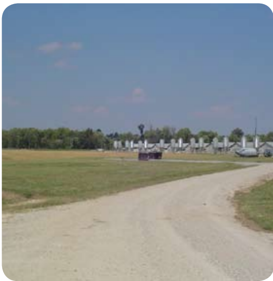
The main entrance to Murphy Brown Hog Farm

“ViroFlow™ Technology, using ViroPhos™ reagent has an excellent ability to bind soluble phosphate, while still allowing it to be bio-available to plants.”