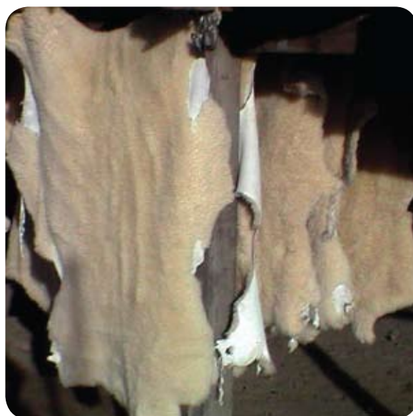
Tasman Sheepskin Tannery produces around 6,000 sheep hides per month.

The pre-existing wastewater system consisted of five settling dams, to which lime and aluminium sulphate were added to precipitate chromium. The ViroFlow™ Technology treatment system involved spraying the primary treatment dam with ViroChrome™ reagents in order to remove chromium, total suspended solids, and sulphates. ViroFlow™ Technology complemented the existing treatment method. There was no significant capital involved with the implementation.