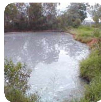
One of the treatment ponds prior to treatment.

ViroFlow™ Technology ensured that chromium concentrations in the waste liquid were well below the trade waste thresholds. A significant result of the application of ViroFlow™ Technology was the substantial odour reduction. Odour at the tannery treatment plant is now barely noticeable.