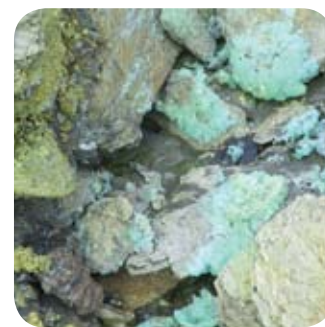
Water flowing into the dam contained very high heavy metal loads, leaving deposits like these.

The contaminated water body known as “Aqua Forte” at EXMIN’s Aljustrel site in Southern Portugal contained very high concentrations of heavy metals and was highly acidic. The water in the tailings dam was characterised as a sulphuric acid solution of iron, aluminium and heavy metals and had a total dissolved metal load in excess of 6,800 mg/L. This equates to approximately 170 tonnes of dissolved metals in the 25 ML tailings dam, and in summer evaporative water loss often raised the metal concentrations further.