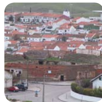
The mine site is close to the township of Aljustrel which dates back to Roman times. Indeed, some of the acid rock drainage generated in the area originates from mining activity conducted by the Romans over 2,000 years ago.

The Aljustrel site is in Southern Portugal on the Iberian Pyrite Belt and is one of several places across the southern Iberian peninsular where the copper rich seam of mineral comes to the surface. The Iberian Pyrite Belt is one of the world's largest volcanic massive sulphide zones, home to 60 mines with several deposits over 100 M tonnes, and has been in production for over 2,000 years. Aljustrel was a mining centre as far back as Roman times.