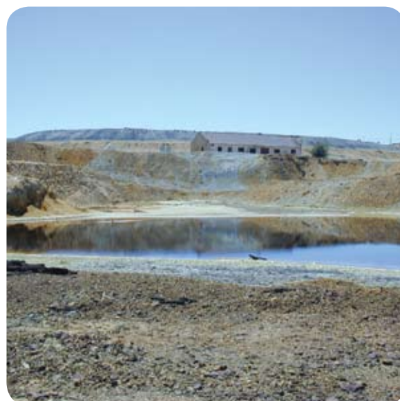
The tailings dam that was treated.

Virotec, in a joint venture with Portuguese company TerraPlus, with whom Virotec has a working agreement in Portugal, was approached by the Portuguese government department known as “EXMIN”, to carry out treatment on contaminated water in order