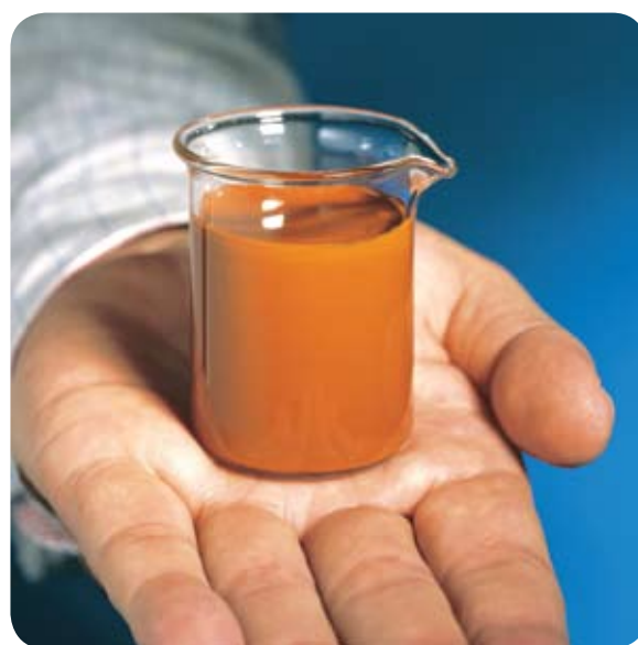
The different ViroMine™ Technology reagents were applied in slurry form.

Several bulk trials (1000L) were conducted over a week long period to validate the laboratory tests and provide information on the behaviour of the sediments already in the dam and their possible influence on the water treatment. Bulk trials at the site established the reaction kinetics for the three selected ViroMine™ Technology reagents and fine-tuned the reagent addition quantities.