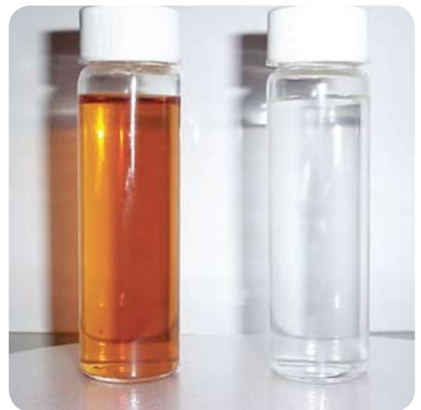
ARD at the Aqua Forte site before and after treatment with ViroMine™ Technology reagents.

Results given in mg/L, with exception of pH. NA: not available