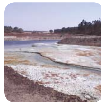
The total dissolved metal load equated to approximately 170 tonnes of dissolved metals in the 25 ML tailings dam.

Acid B Extra™ reagent provides a very high alkalinity to react with strong acid but avoids caustic shock. It also removes As during Stage I as well as most of the Al and Fe.