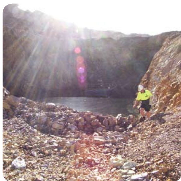
Contaminated water generated in the quarry pit was pumped to the Western Holding Dam.

The ViroMine™ Technology solution components included design, engineering, application and ongoing monitoring. The solution was ideally applicable to the Western Holding Dam; providing both an ongoing treatment for process water and a simple, rapid response to storm water build up in the quarry pit.