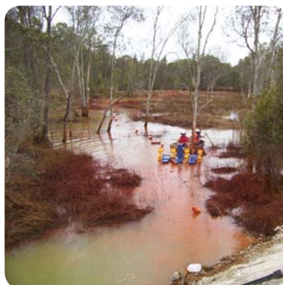
Because of the low water level aerators were used to ensure effective mixing of the Acid B Extra™ reagent.

Table I shows the initial and final characterisation of water quality in the Western Holding Dam. These results show that ViroMine™ Technology is effective for both neutralising acidity and removing heavy metals from water.