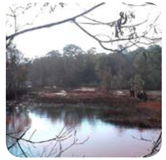
The Western Holding Dam located in a pre-existing wetland area.

The Western Holding Dam is used as an additional storage area for run-off collected from the quarry pit in times of heavy rainfall. However, due to the presence of acid generating rock in the quarry, the water is very acidic, with an initial pH of 2.3 and a high metal content; particularly iron, aluminium and copper, the latter being extremely toxic to aquatic fauna and bacteria.