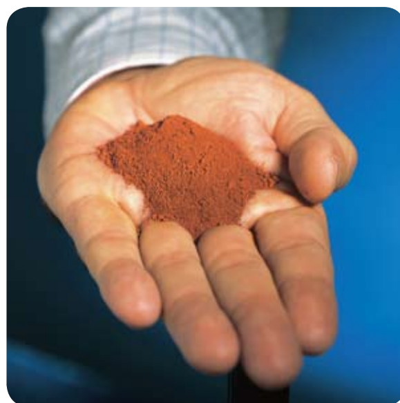
ViroMine™ Reagent Terra B™ is designed to treat sulphidic waste rock and soil.