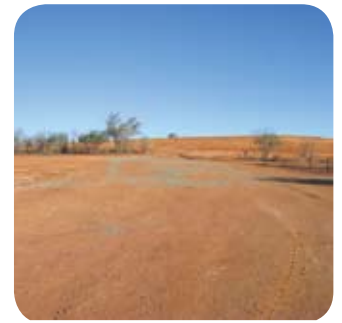
Area C Plots depicting the barren landscape to be remediated.

Waste rock and tailings constitute the largest volume of material that must be stabilised and remediated at mine sites and are often the hardest to remediate because of their chemical and physical properties. The waste rock and tailings can have both immediate (actual) contamination problems and future (potential) contamination problems that will develop as sulphide minerals