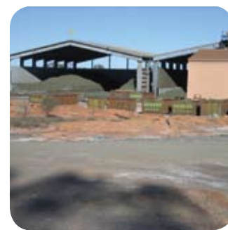
The CSA copper mine is at Cobar, approximately 600 kilometers north-west of Sydney.

CSA was interested to compare the ability of lime and Virotec's Terra B™ to increase soil reaction pH and bind metals, thereby allowing successful revegetation of metal contaminated soils at the site.