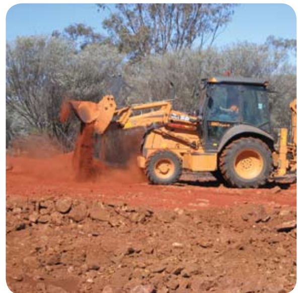
ViroMine™ Technology is alleviating past issues with in-situ immobilisation of metals and neutralisation of acid mine drainage.