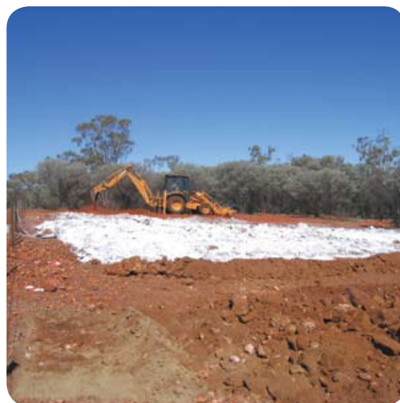
Old smelter plots: Control (foreground), Lime (centre) and Terra B™ treated (background).

When total copper and leachate copper concentrations in the control plot were compared with the lime treated plot and the Terra B™ treated plot, a further reduction in copper leaching of about 85% was found for the Terra B™ treatment when compared to the lime dosed plot.