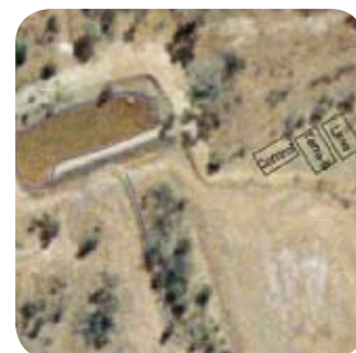
Area C Plots