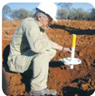
Installation of ViroMine™ Lysimeters in acid waste rock.

Lysimeters were installed in each plot to measure the pore water pH and dissolved metal concentrations after rainfall events. The samples were collected approximately one and four years after the treatment was applied. The results are presented in Table 4 are only available for the Old Smelter Area.