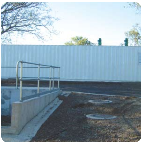
The ViroSewage™ Technology dosing plant at Amberley Sewage Treatment Plant (STP)

The ViroSewage™ reagents consist of a cocktail of very fine grained minerals that each have a positive or negative surface charge depending on the pH conditions they are exposed to. The very fine grain size of the mineral particles gives them a high surface area to volume ratio and a high surface charge to mass ratio. These properties make the reagents extremely surface active, giving them the ability to attract and hold charged particles or polar molecules. The reagents, acting together with other chemical compounds, enhance precipitation, co-precipitation and coagulation, thereby, improving flocculation and producing denser flocs that settle more rapidly. Both suspended solids and organic matter are settled and removed in the liquid stream.