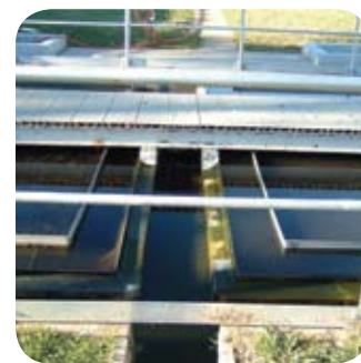
The primary sedimentation facility

Most of the solids entering the plant (as well as debris that has escaped the screen) are collected in this primary sedimentation stage. The flow-splitting channel is not designed to be precise.