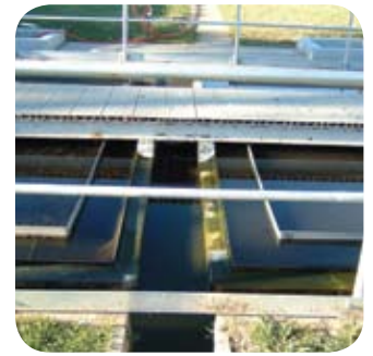
Primary Sedimentation Facility

The Virotec total solution for the RAAF Sewage Treatment Plant at Amberly included plant design, engineering, installation, commissioning, monitoring, evaluation and liaison with relevant parties. ViroSewage™ Technology uses patented reagents in a two-stage process to remove phosphate, reduce Total Suspended Solids (TSS) and Biochemical Oxygen Demand (BOD), and a wide range of trace elements. ViroSewage™ reagent A reacts with phosphate to form low solubility minerals while ViroSewage™ reagent B provides crystal growth templates to enhance the removal of the mineralised phosphate. ViroSewage™ reagent B also removes a wide range of potentially environmentally hazardous trace elements (including: As, Cd, Cu, Cr, Hg, Ni, Pb) from the liquid phase. The precipitated solids are then separated from the liquid phase as part of the normal operations of the STP.