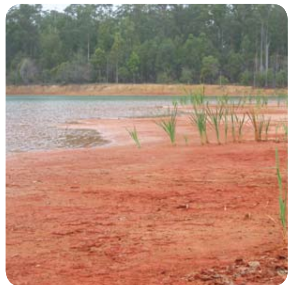
Before treatment using Acid B™ and Terra B™ reagents no vegetation would grow in the exposed tailings or exposed dam walls.

The tailings were tested for pore water metal concentrations using the US EPA TCLP test (Table 2). These data show that the Terra B™ reagent reduced pore water metal concentrations substantially after only two months and data indicate that these results should improve further over time.