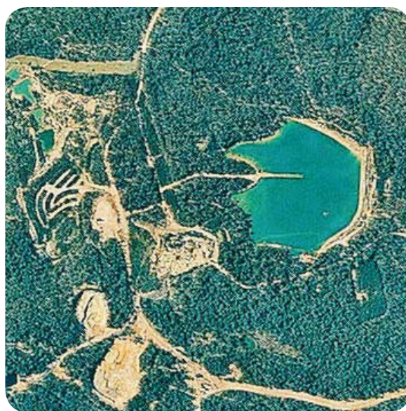
Aerial of the Mt Carrington mine site

The remediation and revegetation that was undertaken on the acid waste rock dumps and haul road verges included clay capping and the addition of lime before planting. Most of these remediation attempts failed due to the presence of acid generating minerals such as pyrite and chalcopyrite, the high actual acidity already generated within the waste rock dumps and the high concentrations of toxic elements.