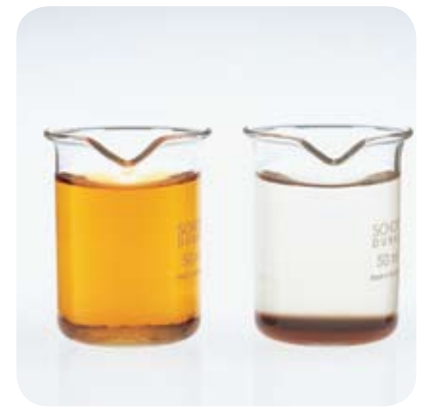
Acid Rock Drainage before and after ViroMine™ Technology treatment.