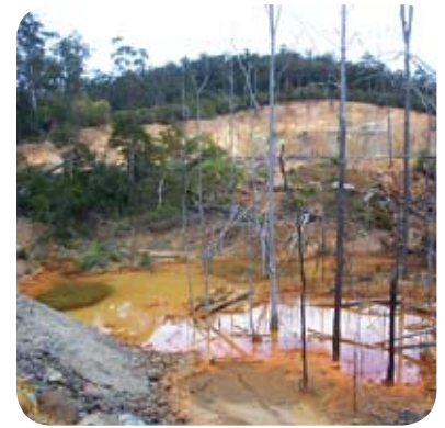
An example of ARD. Mines can generate ARD for thousands of years.