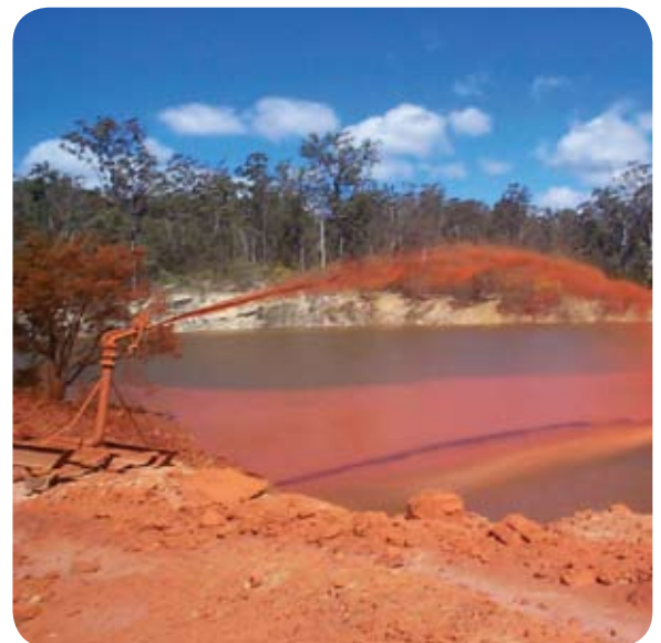
ViroMine™ Technology reagents are applied to tailings dams in a single stage, in-situ treatment.