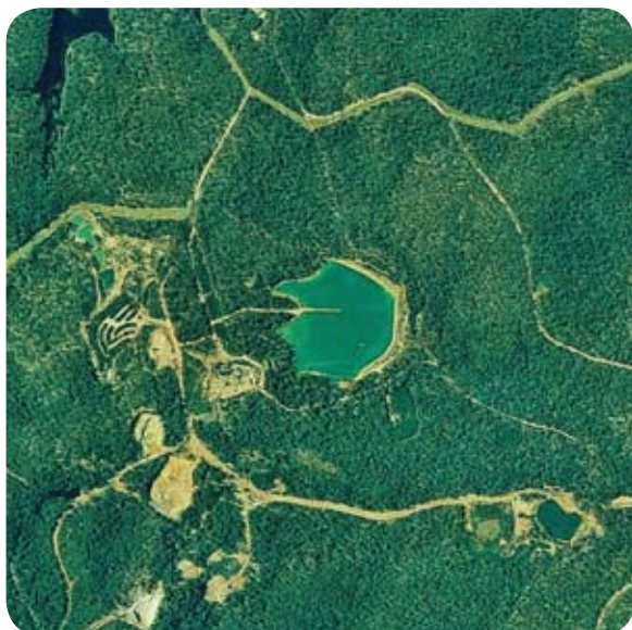
The contaminated tailings dam contained 1.6 billion litres.