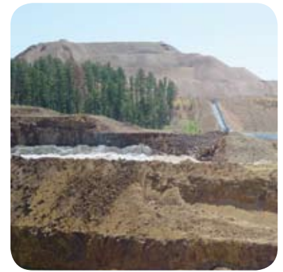
The vast quantity of heap leach ore remaining on the heap leach pad.