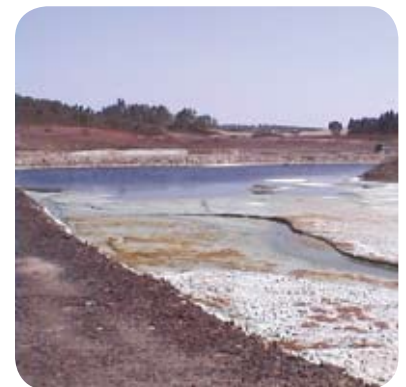
In this 25 ML tailings dam the total dissolved metal load equated to approximately 170 tonnes of dissolved metal.