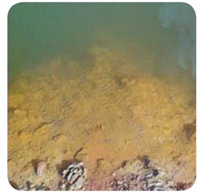
Contaminated water in the tailings dam before treatment with ViroMine™ Technology.

In 1996, a major inflow of water almost filled the 35 acre dam. The situation deteriorated over time, and grave concerns regarding uncontrolled discharge across the spillway or breach of the dam wall were expressed by environment authorities.