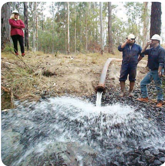
First release of treated water using ViroMine™ Technology from tailings dam.

In 1999, Virotec undertook the treatment of the 1.6 billion litre tailings dam, using ViroMine™ Technology Acid B™ reagent, which was sprayed on to the surface of the dam. Following treatment, the dam water met stringent ANZECC standards for heavy metals and the protection of aquatic ecosystems. Approximately 350 million litres of water were subsequently released with safety into the local catchment.