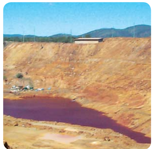
The treated pit at Gilt Edge Mine