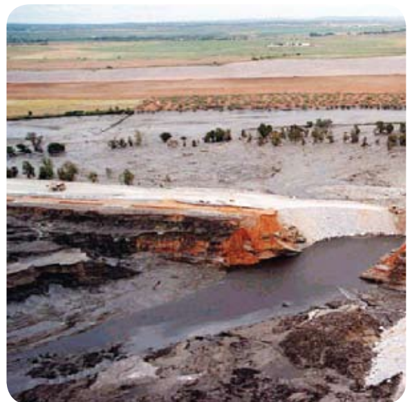
The damage caused by Acid Rock Damage can have severe impact on humans, livestock, aquatic life and property

Typical sources of Acid Rock Drainage at mine sites are underground workings where ground water percolates through a honeycomb of tunnels and shafts, piles of waste rock, mining overburden and exposed tailings. Mines may be a source of Acid Rock Drainage for thousands of years.