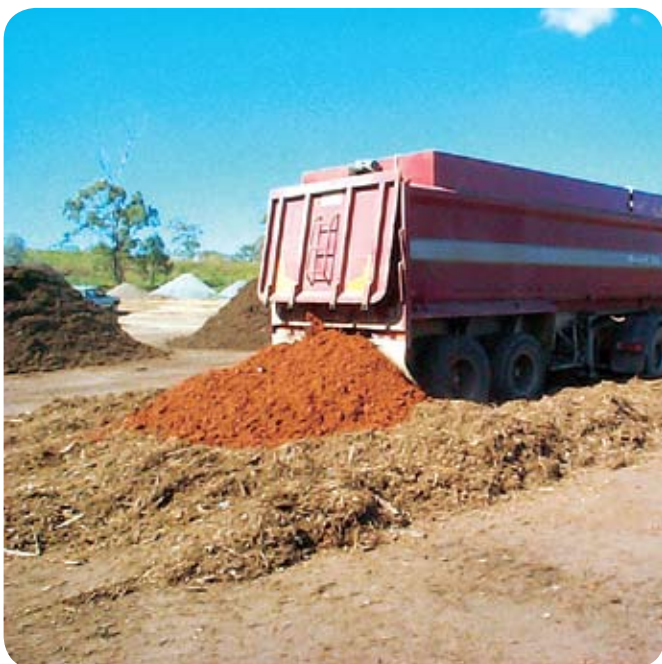
ViroSewage™ Technology applied to enhance composting quality.

Traditionally, all facilities handling bio-solids produce odours and frequently composting facilities are forced to operate at reduced capacity due to objectionable odour issues.