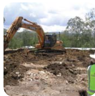
An example of ex-situ treatment of As-, Cu-, and Cr-contaminated soil at Parkside Timber, a timber preservation site in Queensland, Australia. This site was a high-profile contaminated site with direct involvement and oversight by the Queensland Environmental Protection Agency.

As with acid neutralisation, the ability of ViroBind™ reagent to immobilise trace metals in soil increases over time, and over about 24 hours, 1.0 kg of ViroBind™ reagent has the ability to strip more than 1,500 milli-equivalents of metals from water in contact with it. Where the ViroBind™ reagent is in contact with metal contaminated soil in the presence of water, metals can be transferred to the ViroBind™ reagent through the fluid intermediary. Most trace metals are initially trapped by adsorption, which is particularly efficient because ViroBind™ reagent is dominated by particles with a very high surface area-to-volume ratio and a high charge-to-mass ratio. However, adsorption alone does not explain the ability of ViroBind™ reagent to immobilise trace metals, because when desorption tests (using compulsive exchange reagents) are carried out on ViroBind™ reagent after it has been fully loaded with metals and aged for seven days, much less than 20% of the metals taken up by ViroBind™ reagent (less than 5% for As, Cd, Cr, Cu and Zn) can be recovered. Furthermore, the longer the metal loaded ViroBac™ reagent is left to age, the lower the proportion of the bound metals that can be recovered.