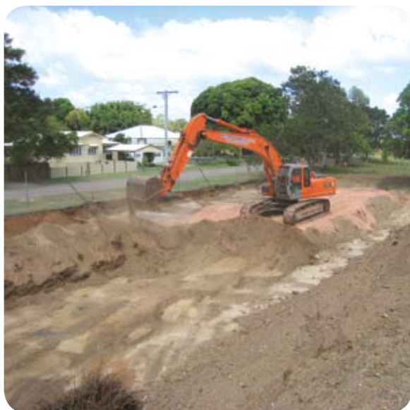
An example of in-situ treatment of lead-contaminated soil at Westrock Development, a disused industrial site in Queensland.

When mixed with soil, the grains of ViroBind™ reagent simply remain where they are; their mineral constituents have a very low solubility. After treatment, the grains are inert and pose no environmental hazard. ViroBind™ reagent is an environmentally friendly treatment for intractable environmental problems such as acid, arsenic, and heavy metal contamination of soils. It is innovative, efficient and cost effective. The acid neutralising capacity of ViroBind™ reagent is provided by a mixture of carbonate, hydroxide and hydroxycarbonate minerals, but some of these react slowly providing a long term source of alkalinity.