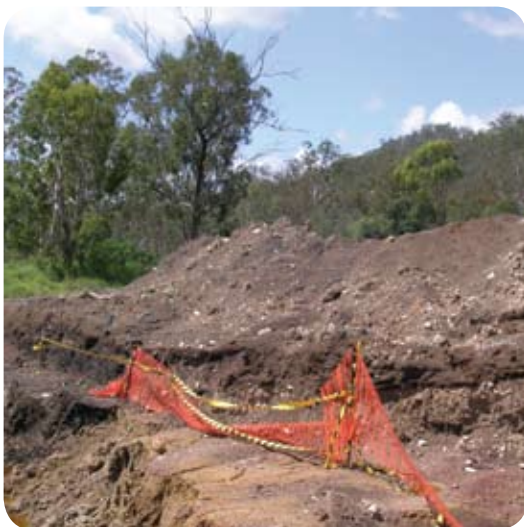
Contaminated soil stockpile at Parkside Timber.

This table shows total metals in contaminated soil, TCLP metals in leachate prior to treatment with ViroSoil™ Technology, and TCLP metals in leachate after application of ViroSoil™ Technology.