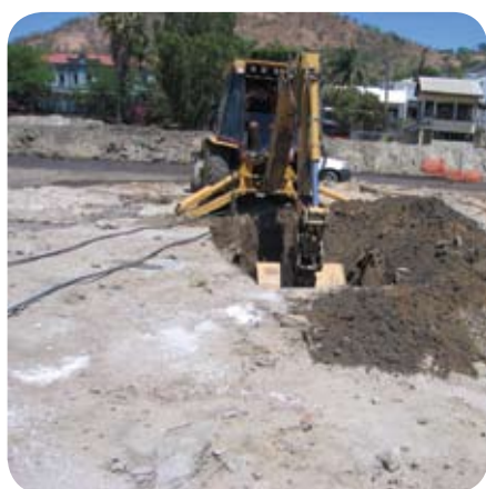
Mixing at the CEC Construction site.