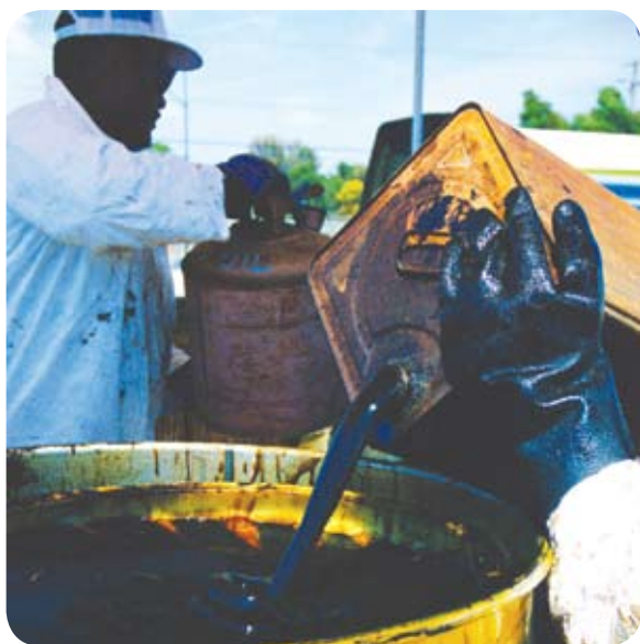
Soil contaminated by hydrocarbons such as oils is just one of the many serious waste streams identified worldwide.

ViroSoil™ Technology uniquely combines several strengths. First, in addition to binding heavy metals, targets many different hydrocarbon contaminants simultaneously. Second, it preferentially absorbs hydrocarbons in the presence of water and contains nutrients that promote the growth of indigenous aerobic or anaerobic micro-organisms present in the ViroBind™ and ViroBac™ reagent matrix. Third, ViroBac™ reagent supports the growth of