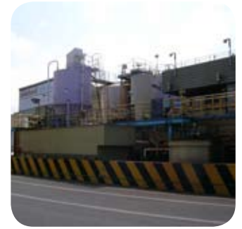
The BlueScope Steel site.

This table shows the total concentration of hydrocarbons in a contaminated oily sludge after treatment with ViroSoil™ Technology.