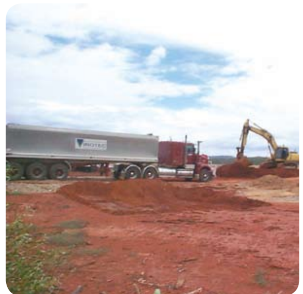
ViroBind™ reagent being added to a contaminated site prior to mixing.